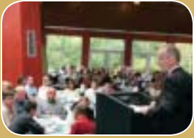
2005 Global Buyers Mission Update - pg 2