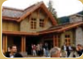
2010 Infrastructure Initiative - pg 3