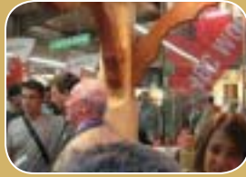
Salon Maison Bois 2005 - pg 8